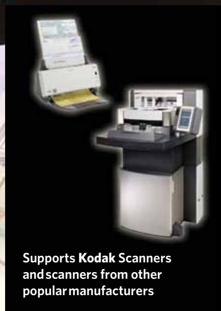
Supports Kodak Scanners and scanners from other popular manufacturers